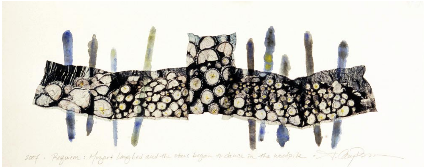
Cary Brown Requiem , 2007 Polaroid emulsion lift and watercolor on paper