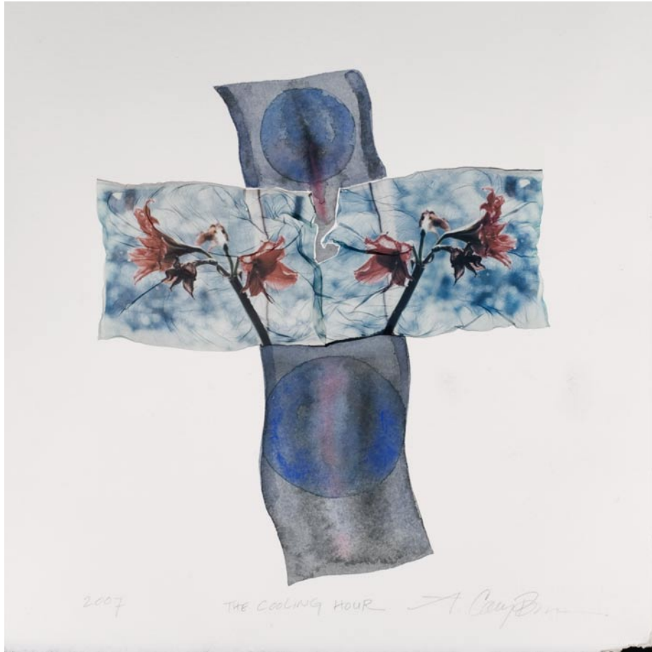
Cary Brown The Cooling Hour 2007 Polaroid emulsion lift and water- color on paper