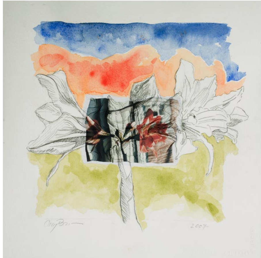
Cary Brown Amaryllis , 2007 Polaroid emulsion lift and water- color on paper Image © the artist Courtesy of the artist and