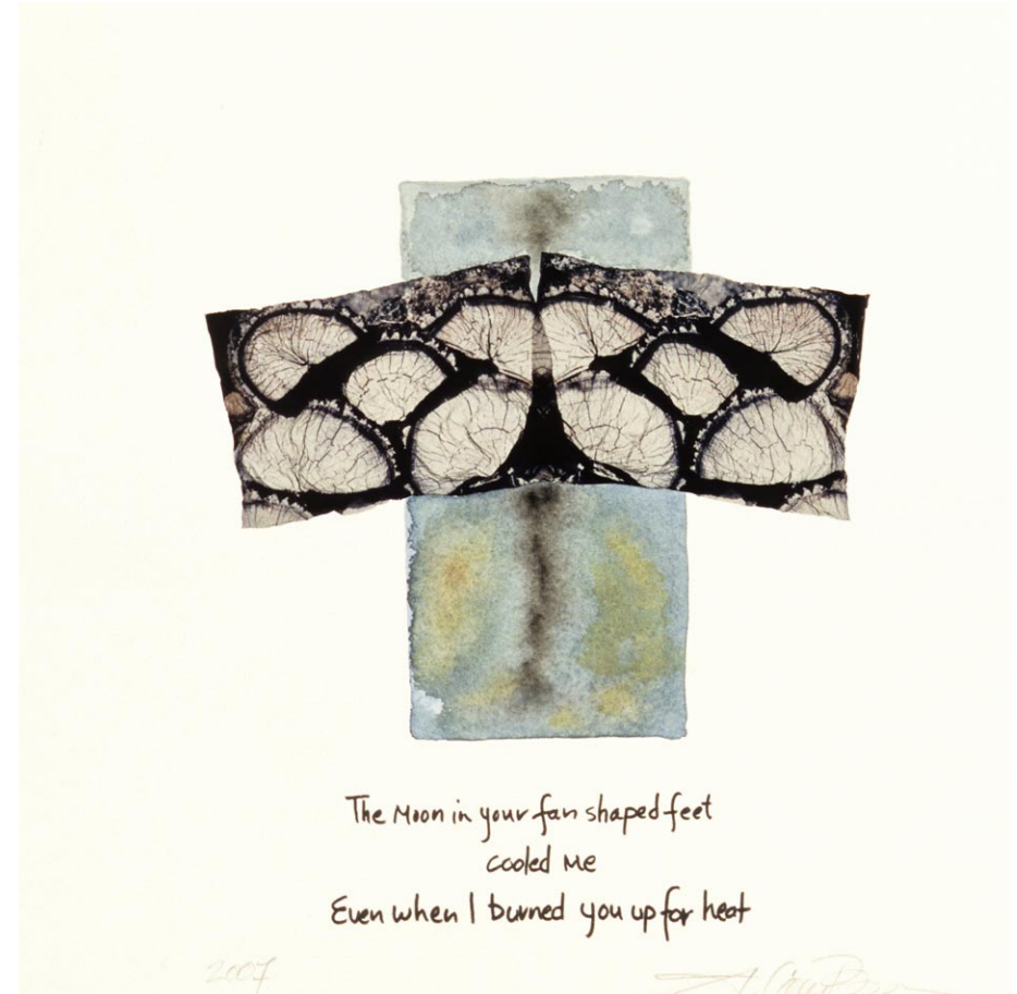
Cary Brown Your Fan-shaped Feet , 2007 Polaroid emulsion lift and water- color on paper